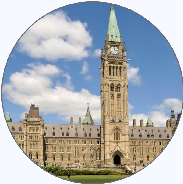
MEMBERS OF PARLIAMENT